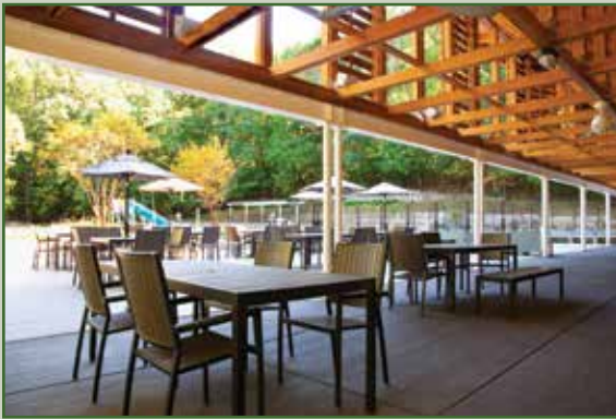
© Julia Heine / McInturff Architects