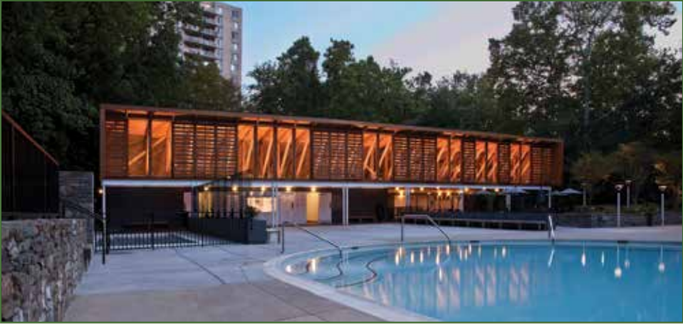
© Julia Heine / McInturff Architects